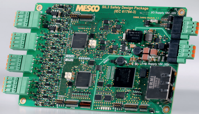
Safety Option Board

Talk to us about your requirements and your development needs.